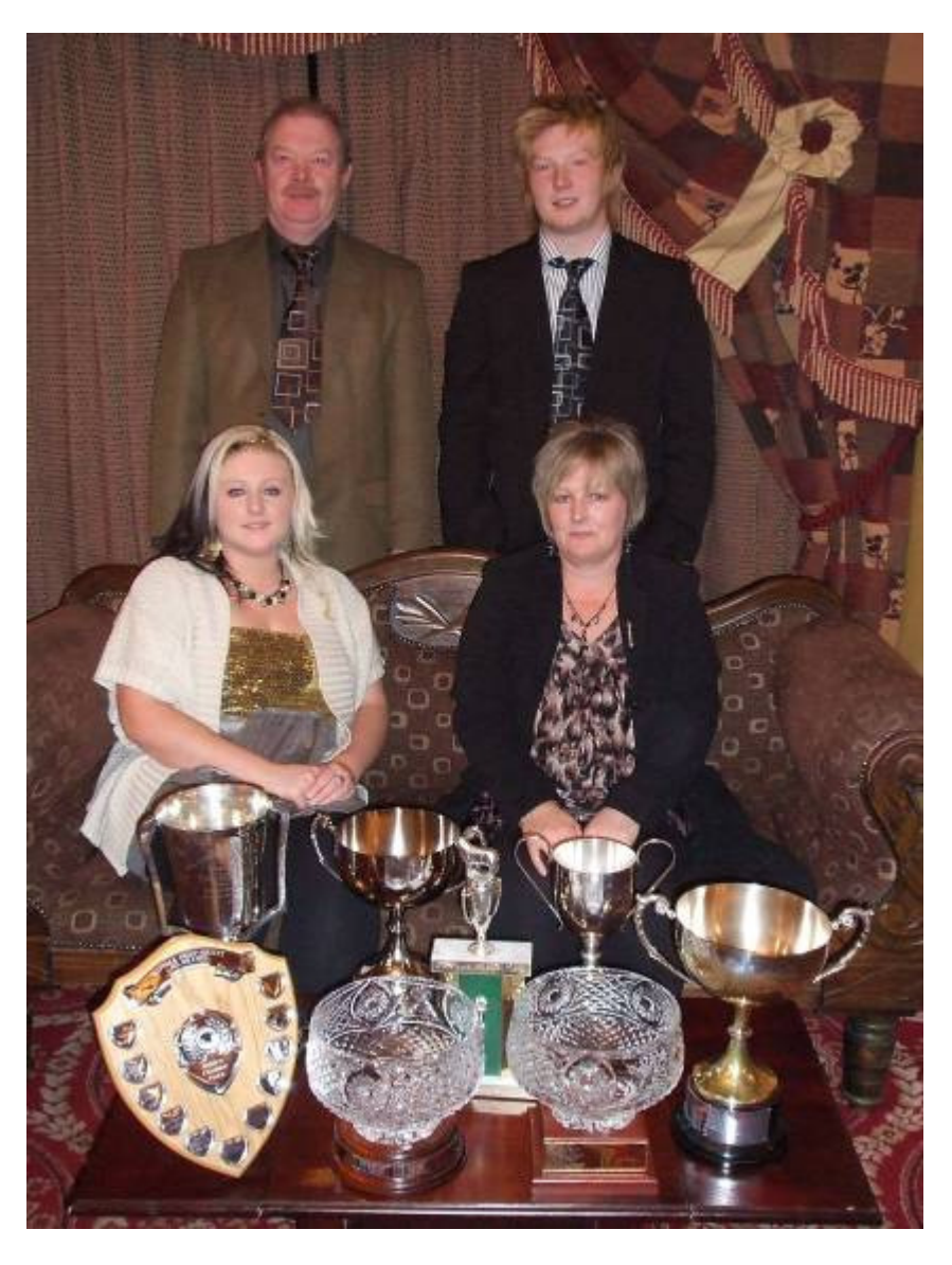
The Priestley family show their array of trophies