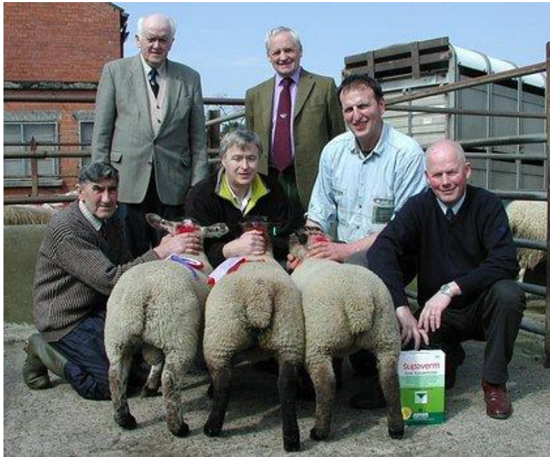
Supreme Champion Pen